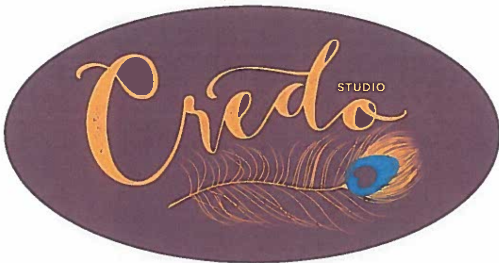
Photo Embossed on Aluminum