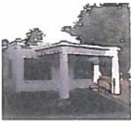
The Luck Museum Carl Martin Luck Memorial Park 3rd & Monterey Streets